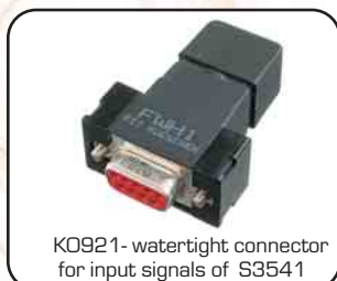
KO921- watertight connector for input signals of S3541