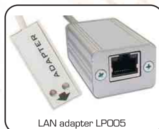
LAN adapter LP005