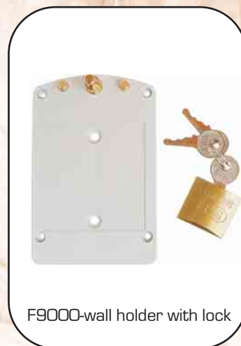
F9000-wall holder with lock