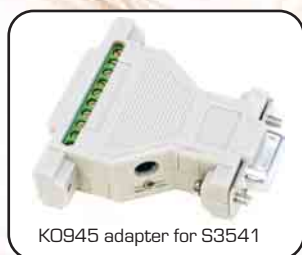
KO945 adapter for S3541