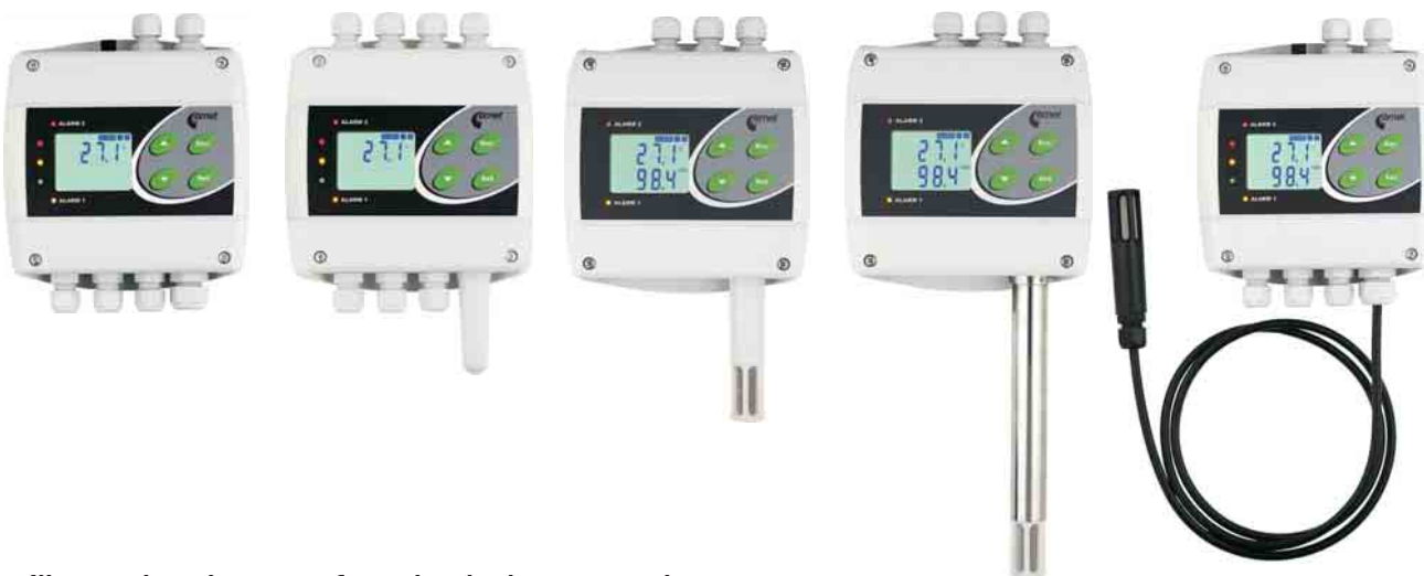
Illustrative pictures of mechanical construction of Hxxxx transmitters