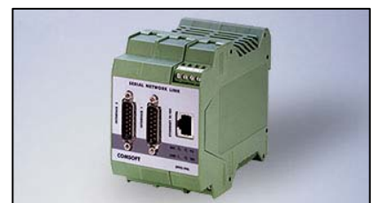
SNL2-E – Serial Network Link